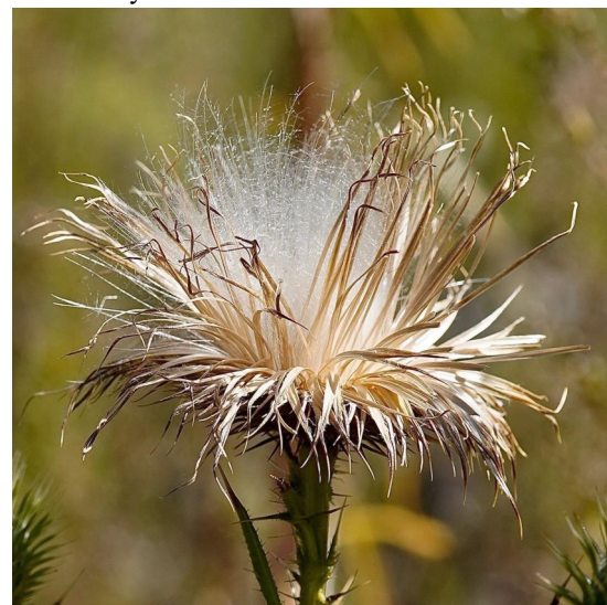
Thistle by Katherine

brought from Europe, 1700's. Roots have flavor of coffee when brewed. With the sky blue color some tribes used it in ceremonies. It is mostly seen along roadways.