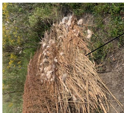
Burn pile full with cattail blossoms.

Unfortunately the ragweed Ambrosia , growing in same season produces a natural substance called histamine for which goldenrod was falsely blamed for giving the objectionably effect on the human respiratory system.